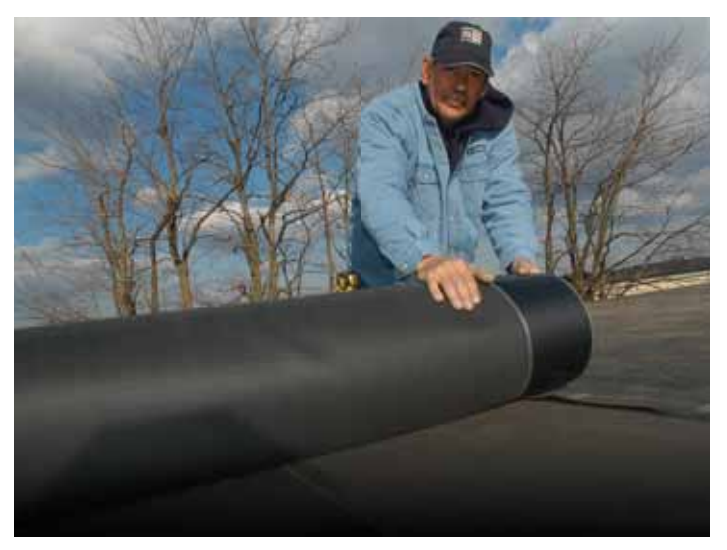
Seam set-up is simple using pre-marked sheets with Factory-Applied Tape.

When Carlisle developed the first EPDM field sheet with Factory-Applied Tape, single-ply splicing technology took a massive step forward. Available on Carlisle's Sure-Seal®, Sure-Tough™, and Sure-White® EPDM membranes, Factory-Applied Tape enhances seam performance and contributes to significant labor savings.