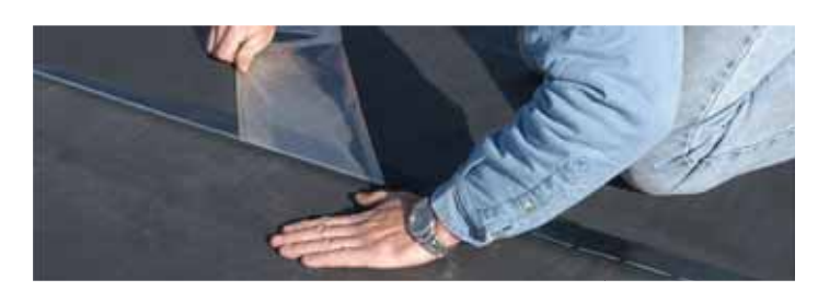
Seams completed with Factory-Applied Tape go together smoothly, resulting in fewer wrinkles.

For more than five decades, Carlisle has led the roofing industry in the development of innovative, labor-saving products. The industry was revolutionized once again when Carlisle introduced its EPDM membranes with Factory-Applied Tape. Applied in a factory-controlled setting that results in increased quality, reliability, and seam performance, Factory-Applied Tape also provides the fastest and easiest way to create a seam between two single-ply membranes.