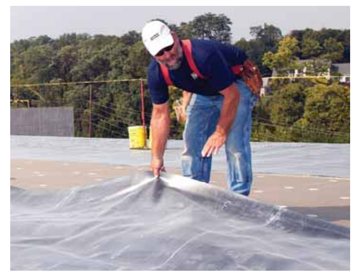
Locate the orange "TOP SHEET" sticker on 2-packs to ensure proper roll-out.