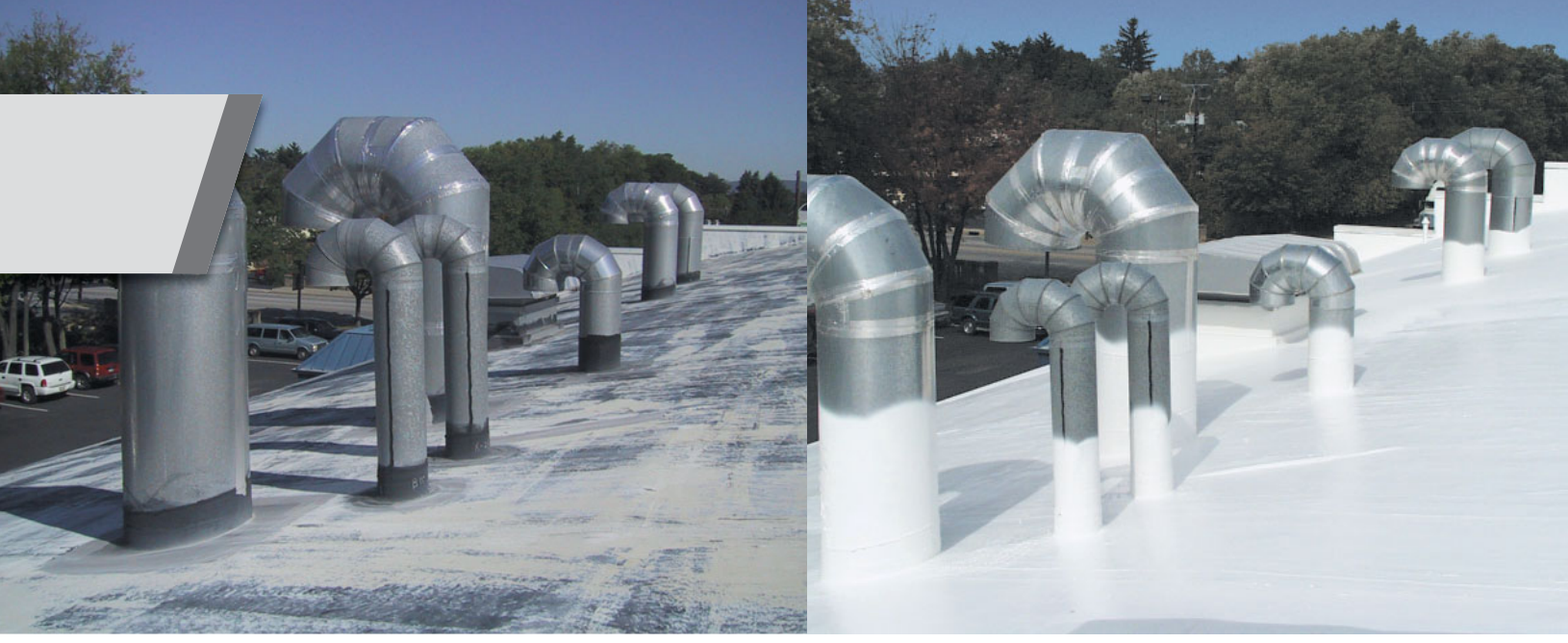
Before: Overview of existing 39-year-old Carlisle roofing system.